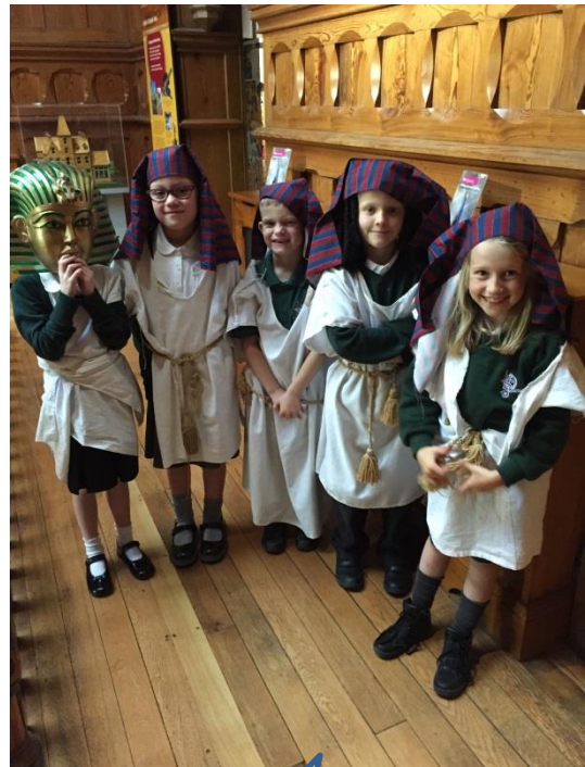
Year 3 in traditional Egyptian dress.